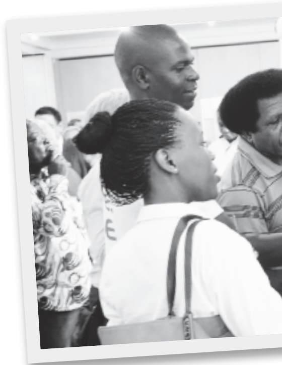
Handing out the certificates